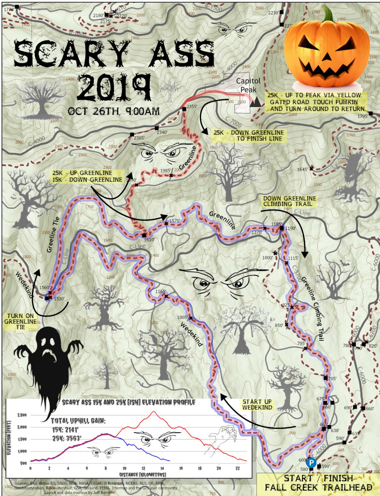
SCARY ASS 15K AND 25K (15K) ELEVATION PROFILE